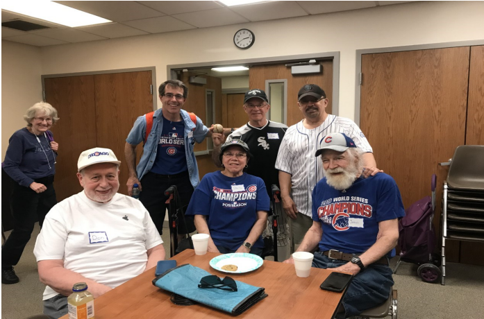
Senior Social Club members celebrating baseball's opening day at their monthly meeting.