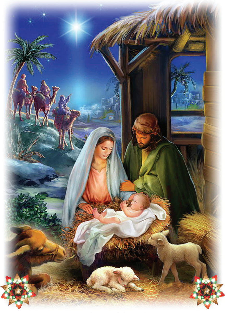
QUEEN OF APOSTLES CHURCH 2330 w. sunnyside ave., chicago, il 60625 7:00 P.M. | WEDNESDAY | DECEMBER 22, 2021